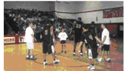
The Somers MagicBusters had fun keeping pace with the Harlem MagicMasters.

Two basketball games featuring the Harlem MagicMasters versus the Somers MagicBusters (teachers, administrators and students) were enjoyed by more than 700 residents at Somers High School on May 20.