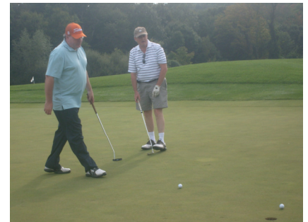
Golfers look to score a birdie on the green during the SEF Golf Outing at scenic Anglebrook Golf Club.

SEF raised more than $14,000 at its ninth golf outing held September 24 at Anglebrook Golf Club. Nearly 50 golfers enjoyed the warm and nearly-perfect early autumn day weather on the challenging but scenic and enjoyable course. Also included were a barbecue lunch, reception, dinner and prizes for longest drive, closest to the pin and best foursome score. Thanks to all who participated in this event and especially to chairman Bill Faulkner . We are extremely grateful to our sponsors, whose generosity will help SEF tremendously in its grantmaking activities. A list of all sponsors can be found in this issue.